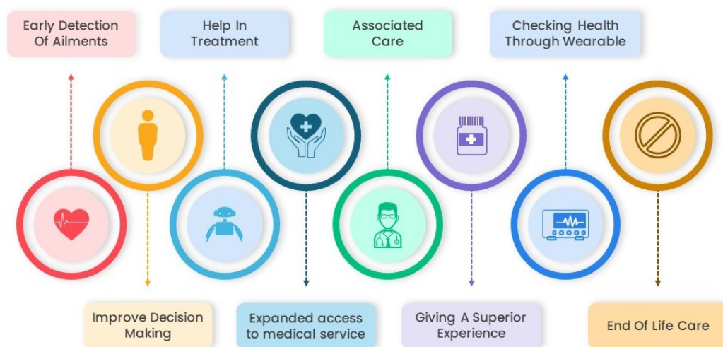
Fig 1. AI in healthcare